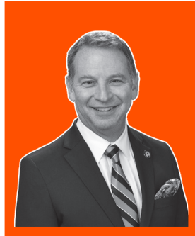
Senator Paul Faraci