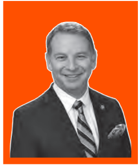
Senator Paul Faraci